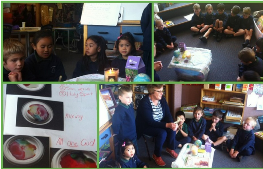
Room One engaged in meaningful prayer.